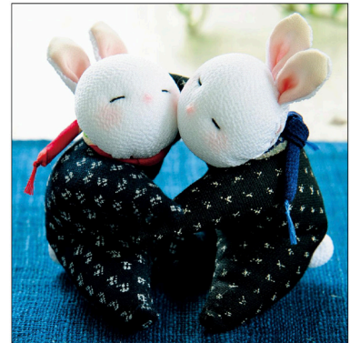
all sorts of critters may be fashioned with only a few modifications